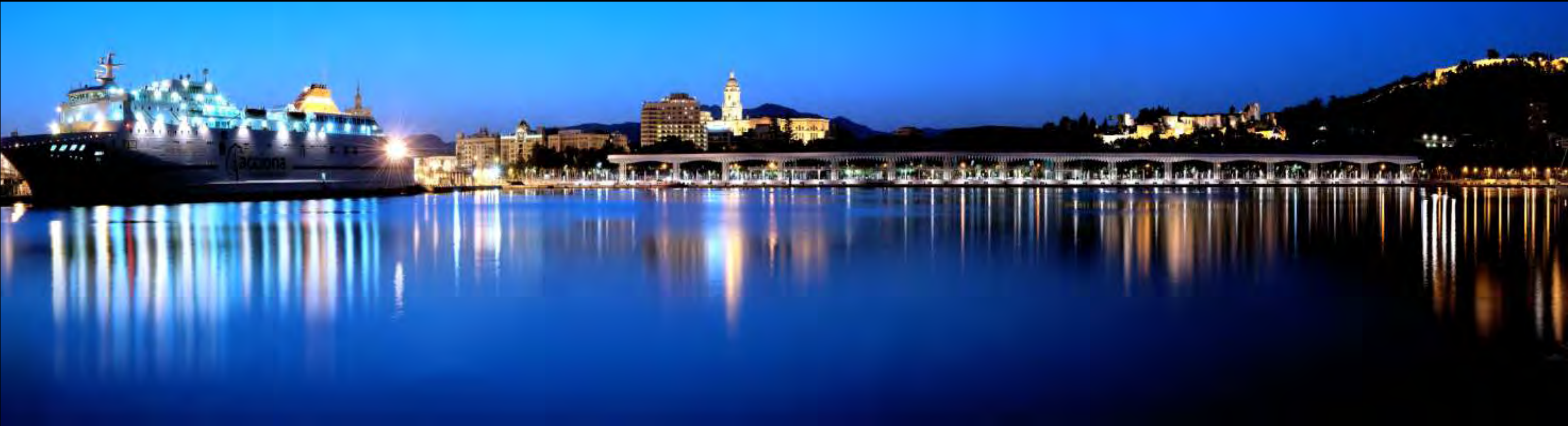
PANORAMIC OF MALAGA & MONUMENTS , MÁLAGA (SPAIN) Client: City Council of Málaga Designed for: Institutional Image of International Promotion