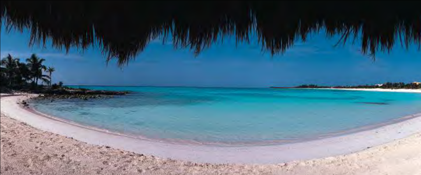
XPU-HA , RIVIERA MAYA (MÉXICO) Client: Palace Resorts Designed for: International Promotional Tourist Image